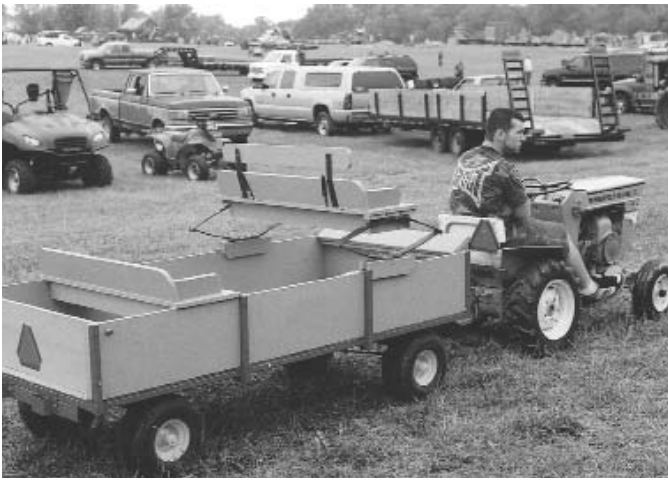
Miniature wagon holds up to 3 easily removable seats. Seat on front sets on a pair of leaf springs that cushion the ride.

Contact: FARM SHOW Followup, Jim Berry, 43 Old Constance Blvd., Andover, Minn. 55304 (ph 763 434-6314; jbdb43@