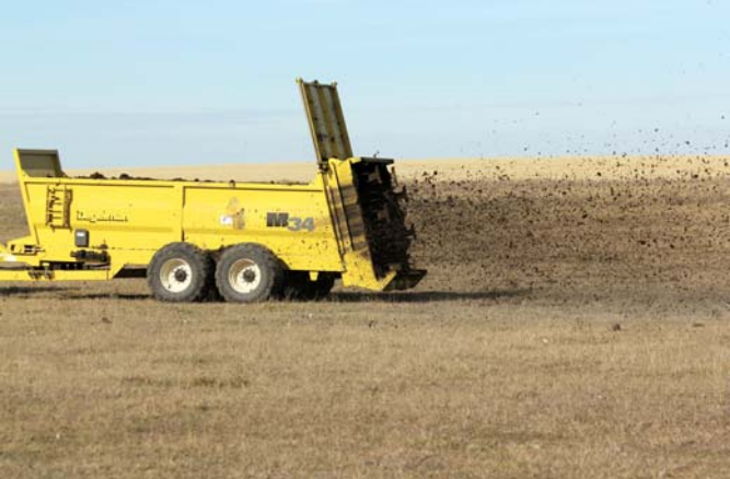
In addition to being big, the spreader has an innovative beater design that eliminates rock damage. \,