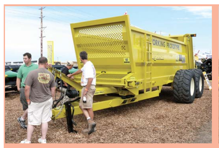
Degelman Industries' new spreader has a capacity of 28 tons. It's designed to move not only manure but also dirt or other material.