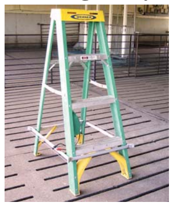
Battery-powered "electric fencer" gives a small electric shock to pigs that get too close to ladder.

Contact: FARM SHOW Followup, Moore Automation, Inc., 411 Main St. E., Trimont, Minn. 56176 (ph 877 767-6897).