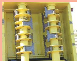
Free-swinging flails have replaceable paddles mounted on 10-in. dia. tubes, Flails collapse if they hit a rock, allowing rocks to pass through without damage.

Contact: FARM SHOW Followup, Degelman Industries, Box 830, 272 Industrial Drive, Regina, Sask., Canada S4P 3B1 (ph 306 543-4447; sales@degelman. com; www.degelman.com).