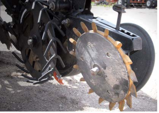
Zipper-like prongs on ring at edge of closing wheel feather soil into the furrow, creating ideal seed-tosoil contact.