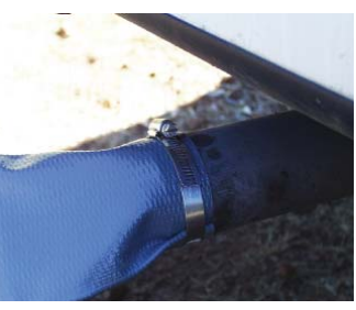
Rigid plastic adapter clamps onto vehicle's exhaust pipe.