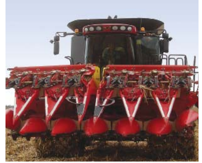
The new Capello corn head can be fitted to most combine brands and is available in a full range of models, either rigid or folding. Chopping rotors are available on all models except the 18-row.

A 12-row non-folding model lists for about $107,200, depending on options. A folding