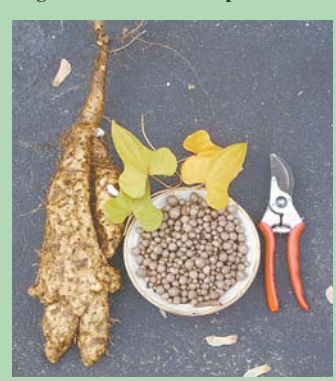
Photo shows an underground potato and small bulbils produced by an air potato relative called Chinese Yams.

For Chinese Yams: Tripple Brook Farm, 37 Middle Road, Southampton, Mass. 01073 (ph 413 527-4626; www.tripplebrookfarm.com).