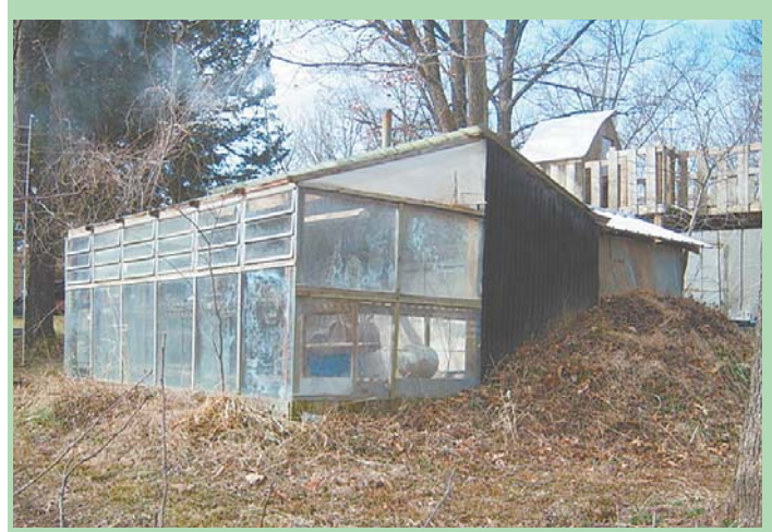
Greenhouse is built into side of hill, with heat from the ground keeping the greenhouse warm. Accment mixer drum is buried in the hill side behind it.