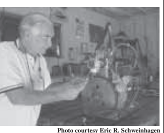
Bruce Crower's 6-stroke engine uses petroleum fuel in its first four strokes and water in strokes five and six.

Bajulaz claims thermal efficiency of 50 percent versus 30 percent for traditional internal combustion engines, 40 percent reduced fuel use, direct injection and optimal fuel combustion at every engine speed. Plus, the company claims almost any type of petroleum or vegetable oil, even animal grease, can be used in the system. This could reduce emissions by 60 to 90 percent.