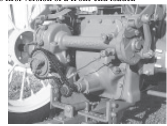
Power lift system is designed to raise and lower a cultivator or a two-way plow and operates independently of the loader. It makes use of two mechanical clutches.