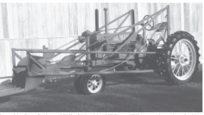
Owned by Dave Badger of Polk, Ohio, this 1937 Deere "B" tractor is equipped with a model 25 "cable lift loader". It was Deere's first version of a front-end loader.

Contact: FARM SHOW Followup, Dave Badger, 285 State Route 604, Polk, Ohio 44866 (ph 419 869-9022; greenbarn285