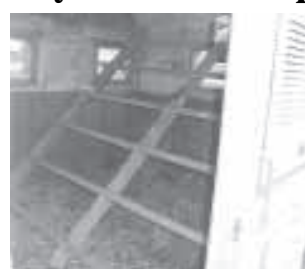
Rows of 2 by 2-in. roosts are located along two walls of trailer, which Ault gutted.

Ault cut a small door in the side of the trailer and built an awning to protect the chickens from predator birds. The trailer is