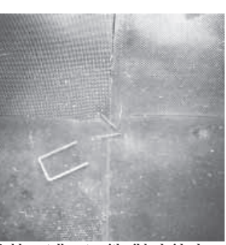
Rubber stall mats with ribbed side down are held in place with large 4 by 7-in. "staples" made from electric fence posts.

Contact: FARM SHOW Followup, Jim Cole, 3241 Oregon Rd., Ottawa, Kansas 66067 (ph 785 242-8284).