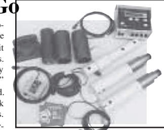
Wagon-mounted scale kit lets you weigh grain in the field.

The kit is priced at $3,495 (Can.) plus S&H and will weigh up to 1,000 bu. For larger grain carts, the company can supply custom kits.