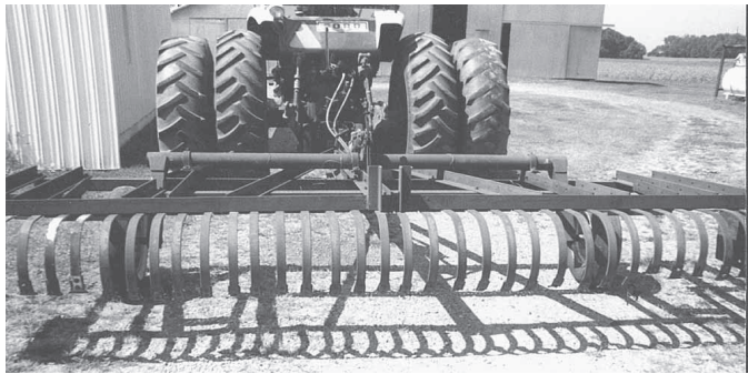
"It does a good job of pulling together rocks that range from softball to basketball size," says Dietz.