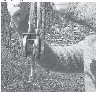
Clear hose runs from a small compressor up to the track rollers. A small shot of air is all it takes to oil the track.

Contact: FARM SHOW Followup, Kenneth E. Ryan, 221 Ryan Road, Oxford, N.Y. 13830 (ph 607 843-6929; CanalHardware@Frontiernet.net).