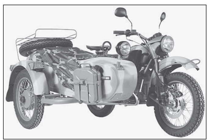
Some owners use these sidecar-equipped machines for winter motorcycling. They can run in moderate depth snow and handle ice and loose gravel better than a conventional motorcycle. "You have to learn sidecar techniques," warns Uren.

Contact: FARM SHOW Followup, Paul J. Dietz, 8538 Lake Rd., Hicksville, Ohio 43526 (ph 419 542-7250).