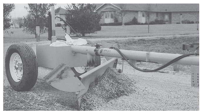
Grader has a 72-in. wide, 16-in. high blade. It rides on 15-in. wheels.