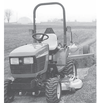
Grader blade has a 6-in. reversible cutting edge and can be fitted with end caps to work as a box scraper. Depth is controlled by a 12 by 2-in. hydraulic cylinder.

"I've used this unit for about a year and