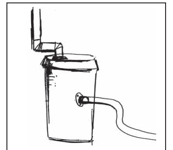
Spencer used thermostat housing to fasten a hose to the garbage can.

Contact: FARM SHOW Followup, Barry Spencer, 545 Line 9 North, Hawkestone, Ontario, Canada LOL 1TO.