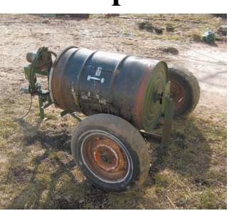
Using a jig saw, he cut a 12-in. wide door into side of drum.

"I mounted the drum off to the side so I could add a second drum adjacent to the first one if I wanted to double my production," Holst says. "I already have a sprocket mounted on the existing shaft ready to drive