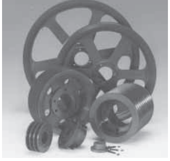
A wide variety of belts and pulleys are available from Georgetown Hydraulics at discount prices.

Contact: FARM SHOW Followup, Georgetown Hydraulics LLC, 343 Christiana