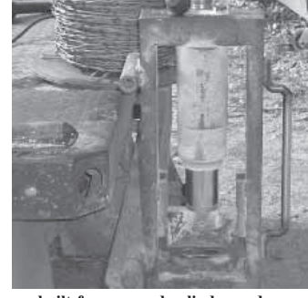
Electric/hydraulic portable pipe flattener was built from a used cylinder and scrap