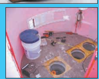
Tank is big enough for two people to fish comfortably. There are four ice fishing holes