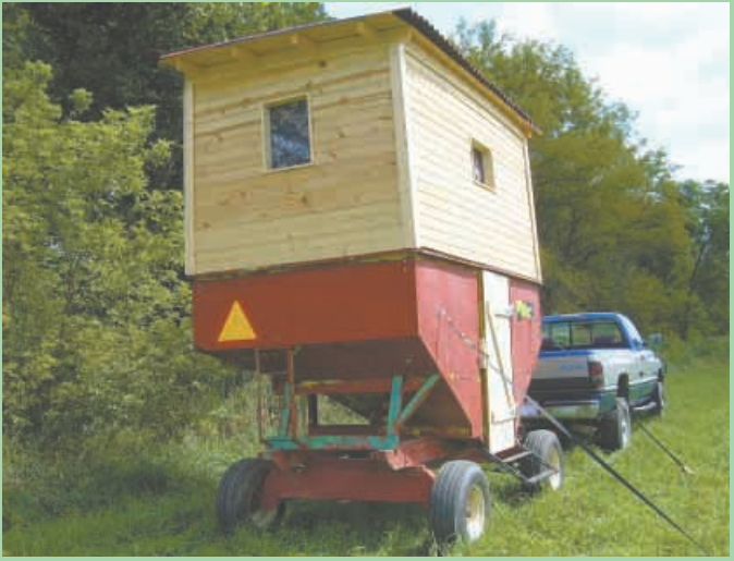
Converted gravity box has a "cabin" on top, making it an ideal mobile hunting blind.

Contact: FARM SHOW Followup, Canadian Tractor Museum, B5414, Westlock, Alberta, Canada T7P 2P5 (ph 780 349-3353, 780 349-3814, or 780 349-5178; revmcfarlane@shaw.ca).