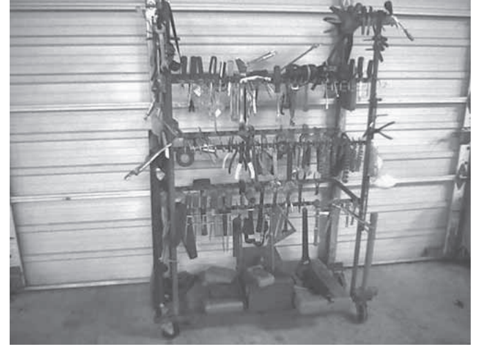
Homemade portable cart is made from welded-together angle iron with pegboard hooks welded to horizontal cross members.

Contact: FARM SHOW Followup, Mel Primrose, Site 10, Box 1, R.R 1, Westlock, Alberta, Canada T7P 2N9 (ph 780 349-2477).