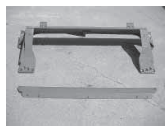
Upgraded feeder house tilt frame for Deere Contour Master combines.

Tschetter adds hooks and some sheet metal, sandblasts and paints the traded-in bracket, and sends it off with the next exchange. Brackets are also available for outright purchase for $1,170.