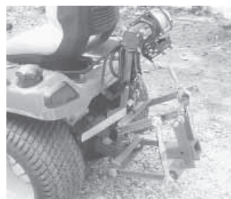
Winch mounts on top of a vertical metal channel that's attached to a pair of hinged metal frames.

"I think it has potential not only for garden tractors, but also for ATV's and utility vehicles," says Ferrante. "I didn't change anything at all on the tractor. My biggest expense was $200 for the winch. I use a tensioner to keep the cable from unraveling