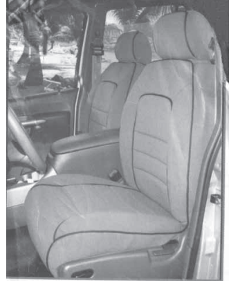
Seat covers are custom-designed to fit your vehicle's specific year, make, model and seat design.