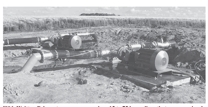
With Written-Pole motors, you can produce 15 to 75 hp on lines that were previously limited to 15 hp motors or less.

Advantages of the new motors, in addition to high horsepower, include low starting current, high efficiency and enhanced reliability. The low starting current eliminates voltage sag interference with other customers.