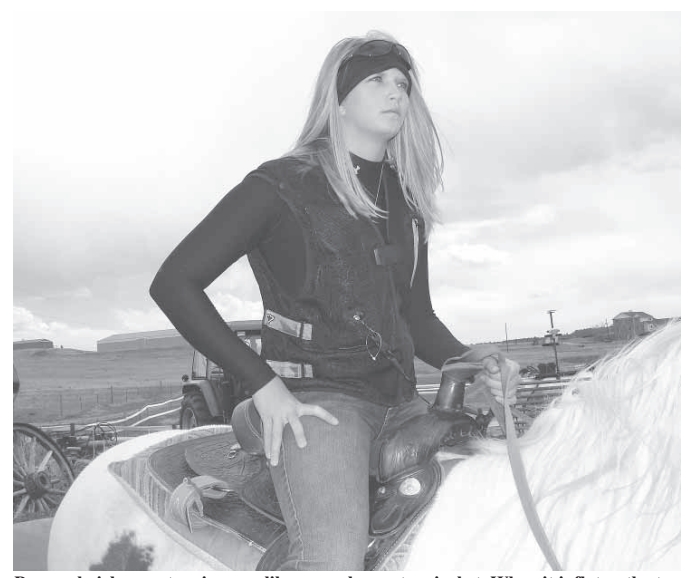
Personal airbag system is worn like a regular vest or jacket. When it inflates, the top pops up and fills to protect the neck and the bottom pops down to protect the lower spine.

Contact: FARM SHOW Followup, Triple T Sales, 7526 E. Burning Tree Drive, P.O. Box 476, Franktown, Colo. 80116 (ph 303 688-8113 or 800 829-8643; fax 303 688-8114; sales@tripletsales.com; www. tripletsales.com).