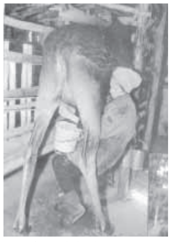
Most of the milking is done by hand. Moose milk is used in the treatment of ulcers and cancers.