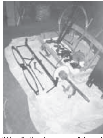
This collection shows many of the car's drive parts. The hub and axle are off an old Allis Chalmers combine.

Like the original, the steering mechanism is a simple tiller affair. Springs were made