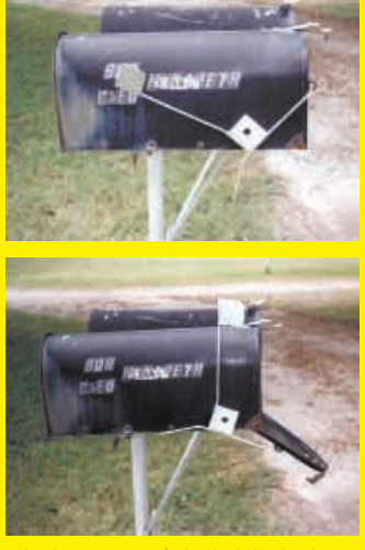
It pivots on a 1/4-in. bolt in the lower corner of the square side piece. I added a roller bearing to the end of the "trip" lever in order to prevent scrapping the paint off the door of the box. The photo explains it better than I can.

I thought your readers might be interested in this simple device I put on my mailbox to tell me when the mail has arrived.