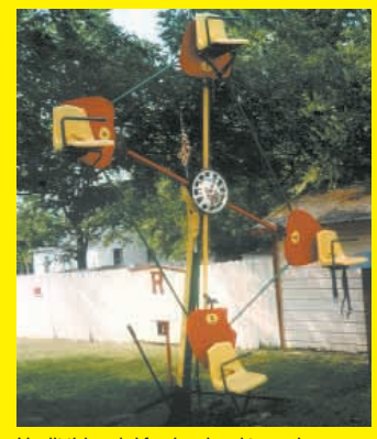
I built this mini ferris wheel to make some extra cash but I need to sell it because of health problems. It's 13 ft. high and electric. It plays old

can step in and out of them without any problems. Besides, most of the time you don't need full-length boots anyhow. (C.F. Marley, Nokomis, III.)