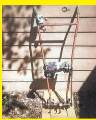
Here's a cultivator I made for tilling in between rows of vegetables. I made some tines out of stainless steel and mounted them between the handles off an old mower. The tines are powered by a 1/2 in. cordless drill that chain-drives the tines. Instead of wheels, I put two skids on it. (Ken Voigt, Wausau, Wis.)