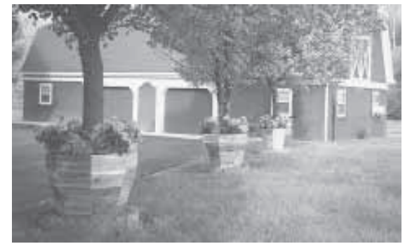
"TreePots" fit around base of tree, adding a decorative touch to your

Contact: FARM SHOW Followup, Hershberger Country Store, 50940 Twp. Rd. 220, Baltic, Ohio 43804 (ans. service 740 623-8658; fax 330 698-3200).