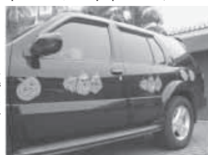
Brightly colored decals are made from soft magnetic vinyl sheeting.

Contact: FARM SHOW Followup, First Hand Medical, 67 South Bedford St., Suite 400 West, Burlington, Mass. 01803 (ph 781 418-6340; fax 781 359-1845; relief@mycarpaltunnel.com; www.mycarpaltunnel.com).