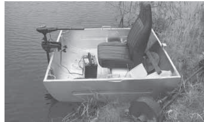
"Once I get the boat in the water, I just take the transport wheel off and throw it behind a seat?' says Leroy Groening. Boat measures 4 1/2 ft. wide by 5 ft. long. When done fishing, Groening attaches the wheel next to the motor and rolls the boat up a plank into his pickup bed.

Contact: FARM SHOW Followup, Leroy Groening, P.O. Box 266, Lowe Farm, Manitoba, Canada ROG 1E0 (ph 204 746-2063; Igi@mts.net; Iginnovations@hotmail .com).