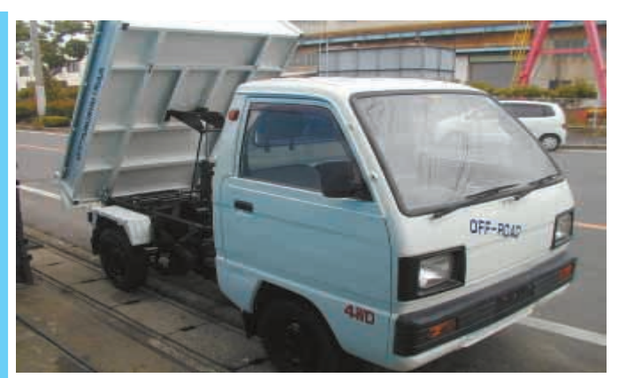
Used off-road mini trucks from Japan are a great value, says importer Paul Stith.

Contact: FARM SHOW Followup, DesignTEQ, 5325 Foundation Blvd., New Albany, Ind. 47150 (ph 812 941-0010 or 877 883-3867; sales@tufftop.net; www. tufftop.net).