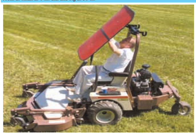
Operator can remove lightweight canopy without ever leaving his seat.

Contact: FARM SHOW Followup, Roger Moe, 36911 200<sup>th</sup> Street, Springfield, Minn. 56087 (ph 507 723-5947; ramm@tier-3.net).