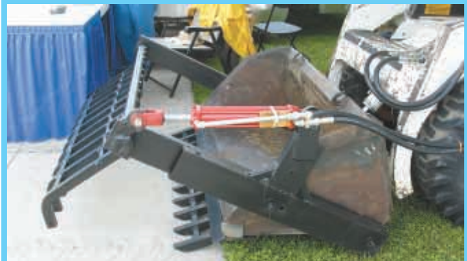
Attachment uses pivoting "fingers" to pull rocks into bucket.