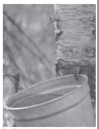
Joe Glaves sells birch syrup that retails for $5 per 2-oz. bottle and wholesales for about $38 per quart to restaurant chefs.

He and five full-time employees collect the sap when it is running during a three