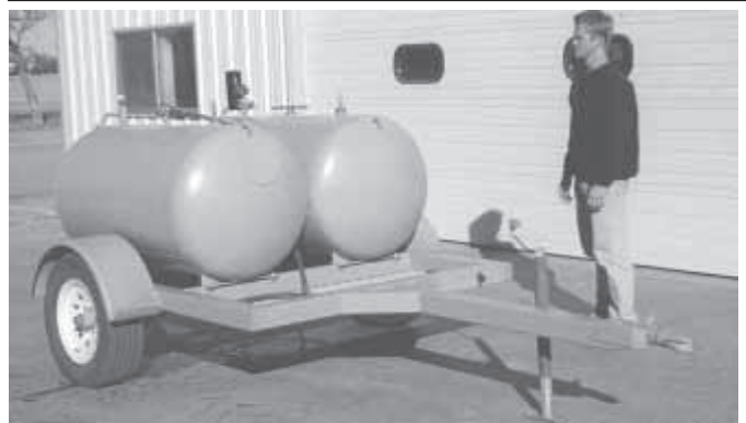
"I spent about $300 to build it. A comparable commercial unit would sell for up to $8,000," says Lonnie Nichols about the portable "oil vac" he built out of an old propane tank.