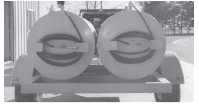
Trailer-mounted rig has twin 200-gal. tanks.

Contact: FARM SHOW Followup, Lonnie Nichols, 2189 40<sup>h</sup> Road, Copeland, Kansas 67837 (ph 620 668-5276; cell 620 272-4915).