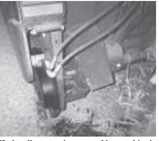
Hydraulic motor is powered by combine's reel speed control and drives auger inde-pendently of rolls and gathering chains.

"I came up with the idea after I bought a 2200 series header three years ago. I liked being able to operate the rolls and gathering