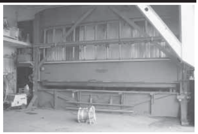
Brake press measures 15 ft. high and has a 20-ft. wide bed. It weighs about 18,000 lbs.

Contact: FARM SHOW Followup, Mark Bruellman, 29731 410th St., Rolfe, Iowa 50581 (ph 800 370-2467 or 712 848-3247).