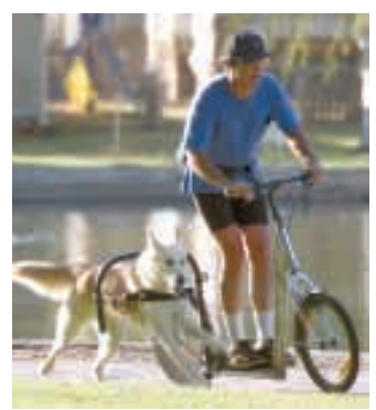
Adult-sized scooter has curved rear outrigger made from bicycle tubing, to which dog can be hamessed. A second or third outrigger can be added.

Accessory packages are available to outfit a second or even a third dog for between $150 and $200 extra.