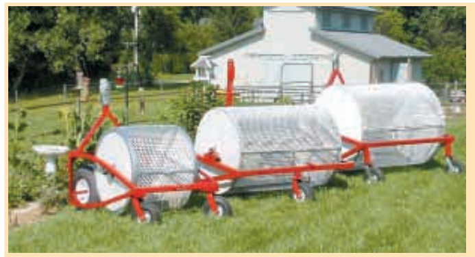
"Rotary" manure spreader "shreds" manure and applies it in a thin layer that quickly dissipates. It's offered in three different sizes.