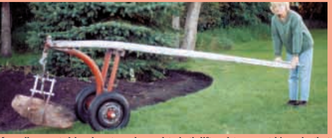
Manually-operated hand cart can be used to both lift and transport big rocks that