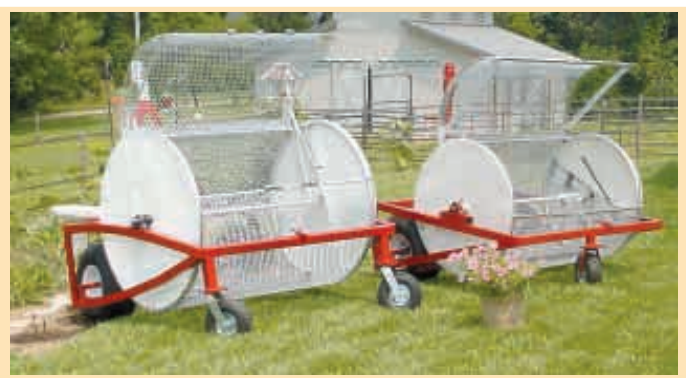
Unit consists of a big expanded metal drum with 1-in. diamond-shaped holes all the way around. Drum rotates as it's pulled through the field.