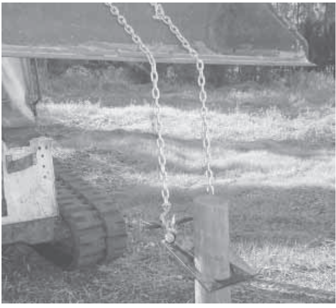
Large post-pulling plate pulls wood posts \ 3\ 1/2 to \ 6 in. in dia.

St., Fairmont, Minn. 56031 (ph 507 283-4134; website: www.cheetah350.com).