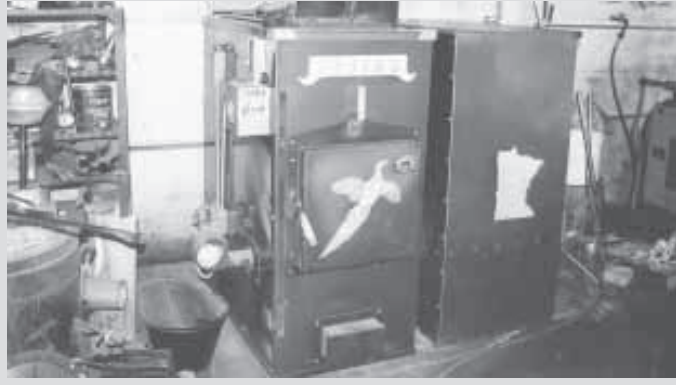
Erickson's stove and corn hoppers are housed in look-a-like cabinets that stand 24 in. wide by 38 in. deep and 48 in. high.

"You can tie into existing duct work in a house or just blow the heat into the air in a shop like mine," says Erickson. "The fellow who bought the boiler put it in the basement