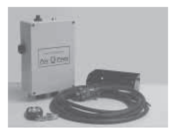
When equipped with GPS, wireless safety switch notifies emergency personnel where you are and shuts down 12-volt equipment.

The Fox Paws 300 can be equipped with GPS (total price with GPS unit is $1,400). When GPS equipped, the unit has a 30-sec. alarm. When the switch is first activated, a buzzer goes off. If the operator doesn't hit the shutoff switch a second time within the 30 seconds, a message is transmitted to a call center. Operators there attempt to reach pre-