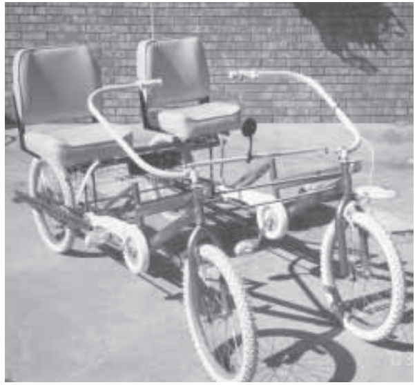
Reclining two-person bicycle has padded seats side-by-side instead of one behind the other.