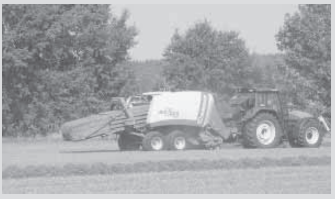
Multi-baler compacts more hay into a smaller space, knotting each bale individually.