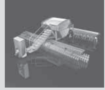
20-ft. wide drill with a large hopper allows for continuous large volume planting.

Contact: FARM SHOW Followup, Kongskilde Maskinfabrik A/S, Slaelskoervej 64, DK-4180, Soroe, Denmark (ph 011 45 5786-5000; website: www.kongskilde.com; email: mail@km. kongskilde.com).