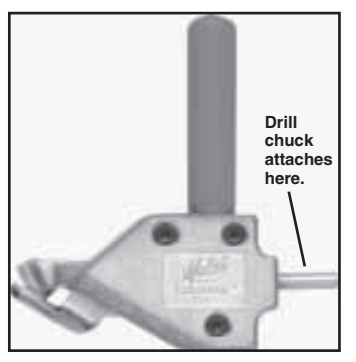
TurboShear attaches to standard 3/8-in. or larger drill chucks. Once mounted on drill, it'll cut through galvanized sheet metal up to 20 ga.

Contact: FARM SHOW Followup, Malco Products, Inc., Box 400, Annandale, Minn. 55302 (ph 800 328-3530 or 320 274-8246; fax 800 206-6760 or 320 274-2269; email: custsvcs@malcotools.com); website: www.turboshear.com).