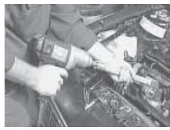
Electric drill drives socket at end of handle, allowing wrench to apply tremendous torque to hard-to-reach bolts.

Contact: FARM SHOW Followup, Herb Hoffman or Rob Zwach, Punch Press Tools, Inc., Box 487, Platte, S. Dak. 57369 (ph 888 243-7311; fax 605 337-3180).