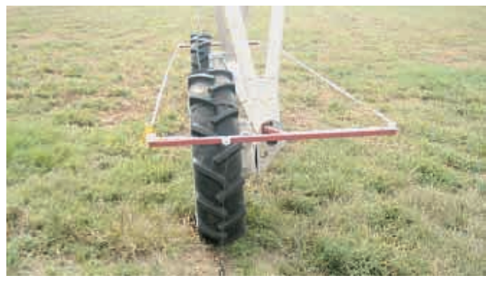
Portable electric fence wraps around each center pivot tower, forming a rectangular enclosure. Wire hanging down in front of tire keeps calves from getting run over.