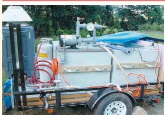
Dunking plants in hot water shows promise as a way to kill common greenhouse insects and bacterial diseases, says a University of Maryland researcher.