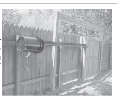
Garage door opener mounts on back side of fence. The 6-ft. wide wooden gate slides back and forth on standard sliding door hardware.

Contact: FARM SHOW Follow-up, Mike Walters, Walters Hatchery, Rt. 3, Box 1409, Stilwell, Okla. 74960 (ph 918 778-3535; Email: turkeylink@intellex.com).