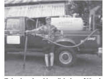
To haul used cooking oil, he has a 200-gal. tank with a pump and long hose mounted on back of his Ford diesel pickup.

He packages the biodiesel in 5-gal. containers for sale as parts cleaner. So far, he's not found a market for the glycerol byproduct, so he's working on a system to burn it. "It's high in water, so it doesn't burn easily. Once you get it going, though, it