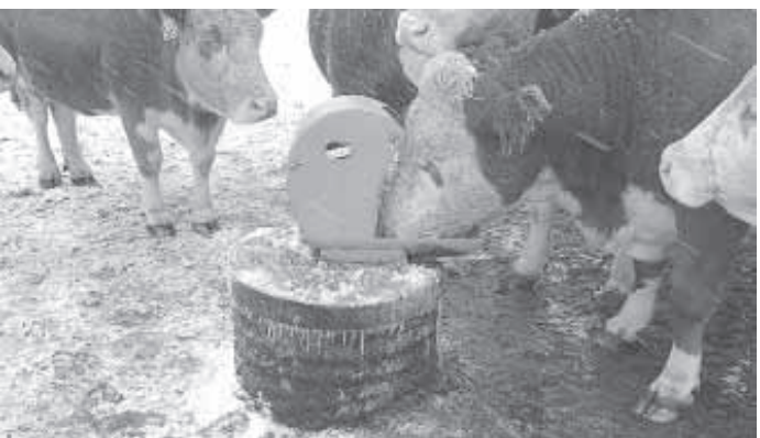
Frostfree Nosepump sits on top of a length of corrugated culvert that's set vertically into the ground.