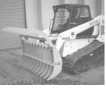
The company offers mounting brackets for most loaders and all Cat. I and II 3-pt. hitches.

"The teeth are made from T-1 steel that has 2 1/2 times the strength of regular steel. You can use this grapple fork to clear fence rows and pile up brush and also to pick it up and move it. The grapple teeth close down to about 3 in. apart. The narrow width of the blade allows you to skim the ground with the teeth and use the unit like a rake on a crawler tractor. The teeth are curved enough that logs slide up them, allowing you to pick up and