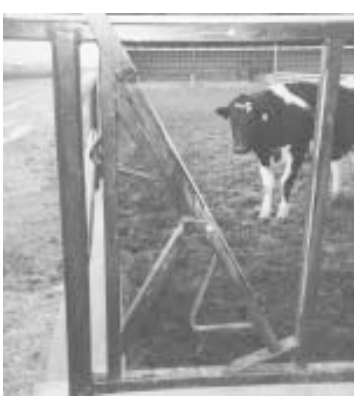
Headlock design allows cows to enter from either the top or bottom.