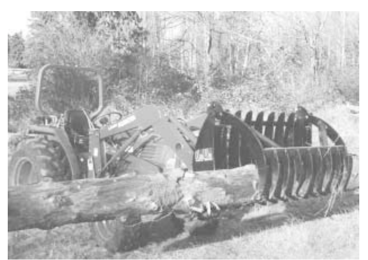
Grapple rake uses a hydraulic-operated grapple to clamp and hold material. "They're ideal for loading logs, picking up rocks, and piling brush," says Anbo Mfg.

Contact: FARM SHOW Followup, Oakwood Game Farm, Inc., Box 274, Princeton, Minn. 55371 (ph 800 328-6647; Website: www.niteguard.com).