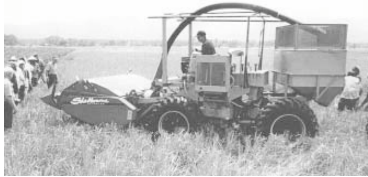
"Mini stripper" consists of a custom-built, 8-ft. Shelbourne Reynolds stripper header mounted on an articulated, 4-WD Case ditcher.