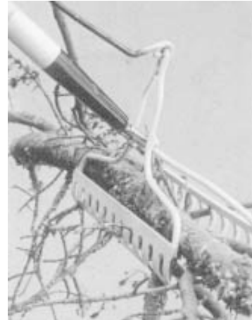
Second rake head pivots downward to pick up sticks, leaves and other debris.

Sells for $29.95 plus S&H. Contact: FARM SHOW Followup, Rake-Up, 12701 Wagner Road, Monroe, Wash. 98272 (ph toll-free 877 772-5387 or 425 823-0800; fax 425 820-5631).