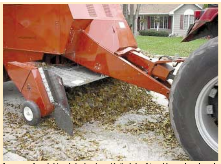
Leaves are funneled into bale chamber with the help of two side panels and a poly cover that mounts over baler pickup.