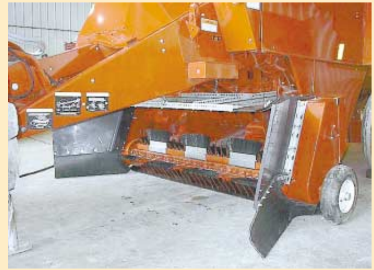
Abrasion-resistant nylon brushes mount behind tines on existing baler pickup. The brushes, which are staggered, sweep up leaves from smooth, paved surfaces.