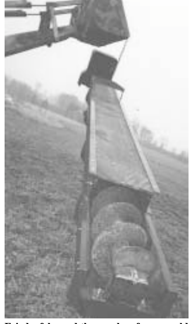
Friedenfels used the gearbox from an old square baler to make a low-cost manure

Contact: FARM SHOW Followup, Mike Friedenfels, Friedenfels Equipment, N1379 Oak Drive, Medford, Wis. 54451 (ph 715 678-2860).