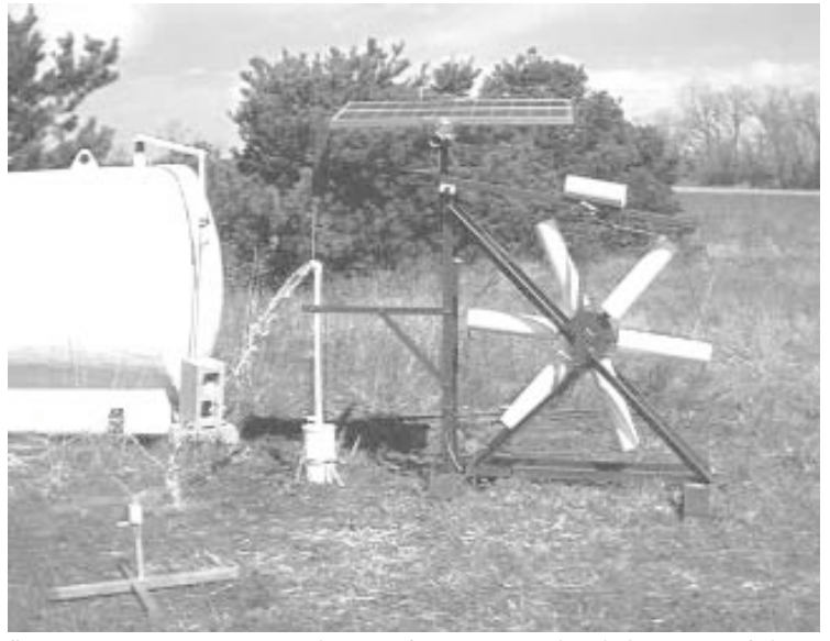
Solar-powered pump has a walking beam/rocker arm design similar to that of oil well pumps. Concrete-filled flywheel kicks in at 40 rpm's to boost efficiency.

The pump is designed to be operated by hand in an emergency and this fall Armstrong plans to introduce a wind-powered alternator that can be attached to the pump in addi-