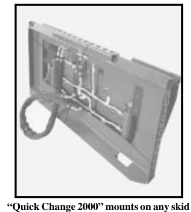
loader equipped with universal quick tach mounting brackets and is equipped with a pair of spring-loaded pins operated by hydraulic cylinders. It eliminates the need to get out of the cab and manually latch or unlatch pins.

"The skid loader's auxiliary hydraulics can still be used for operating attachments."