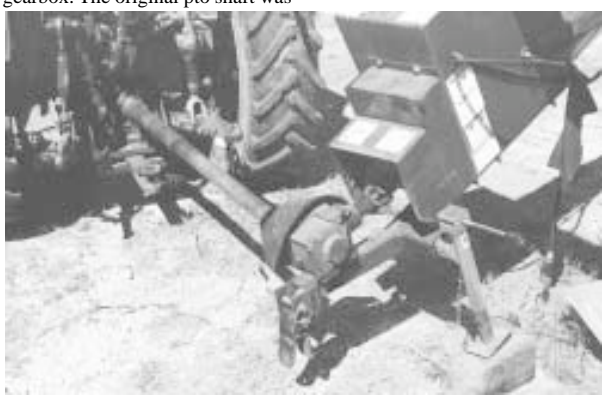
Jacobs replaced auger's original pto driveshaft with a right angle gearbox.

Contact: FARM SHOW Followup, Joe Jacobs, Box 21, Carlinville, Ill. 62626 (ph 217 854-2356).