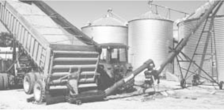
Tractor pto-drives auger at a right angle, which leaves room for a semi trailer to pull right in alongside tractor. Jacobs then pulls swing-away unit into place behind truck.

Sells for $1,195 plus S&H. Contact: FARM SHOW Followup, Tebben Enterprises, 10009 Hwy. 7 S.E., Clara City, Minn. 56222 (ph 320 847-2200).