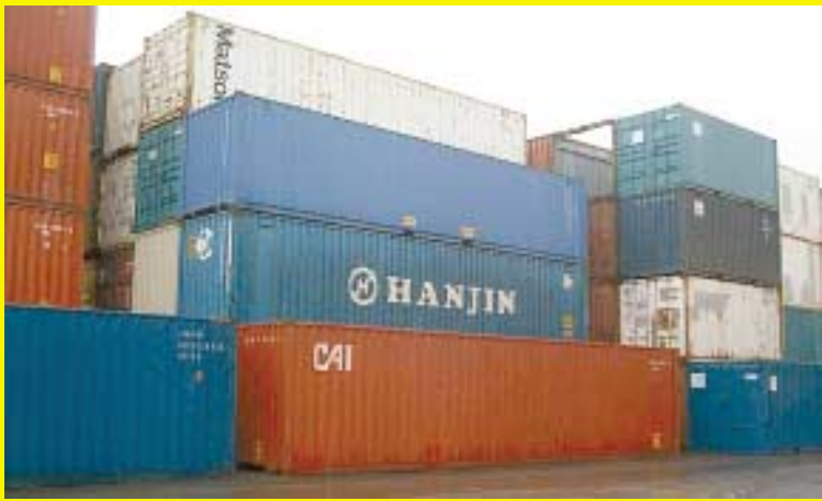
Used shipping containers make low-cost storage for a variety of materials.

Contact: FARM SHOW Followup, Herb Besler or Cliff Kester, Besler Industries, P.O. Box B, Cambridge, Neb. 69022 (ph 308 697-4866).