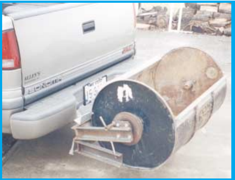
Henderson mounted auto hubs in the center of each end of a 55-gal. metal drum. Frame slips into pickup's receiver hitch.