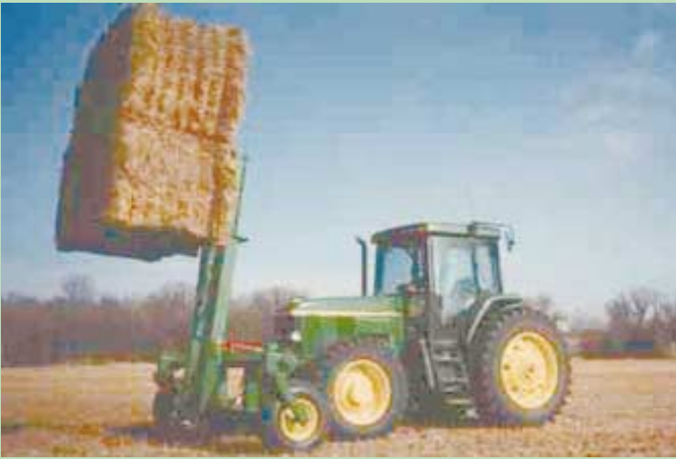
Bale handler attaches to tractor frame by parallel linkage and is supported by two independent castor wheels.