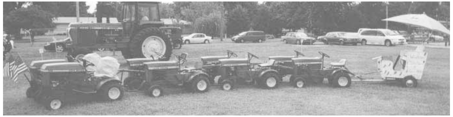
Imagine substituting the horses in the Budweiser team with Deere garden tractors. That's what Bill Sexton did, and it resulted in this "8-horse" Deere hitch and 2-wheeled cart.