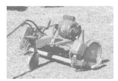
Reel-type mower turns in its tracks, thanks to two small solenoid-controlled feet - one at each end - which drop to ground to stop either end as needed.

Sage joked that the mower is Y2K compliant and emits no emissions, so environ-