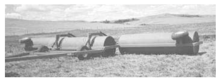
The 48-in. dia. rollers weigh a total of 18,900 lbs. and have a full rolling width of 42 ft.