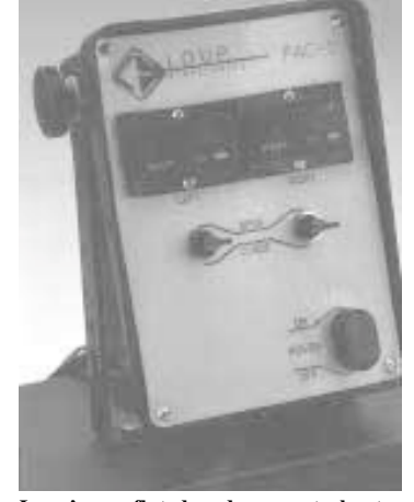
Loup's new fluted seed cup control automatically adjusts the indexed control arm connected to each of the drill's seed cups to change the size of the flute openings.

"Sometimes deer join the horses in the pasture and I noticed that they seemed to have similar grazing habits. So when a new crop