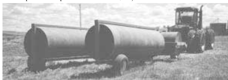
In transport, the frames tilt up on their sides to put the transport wheels on the ground.

Contact: FARM SHOW Followup, Wayne Engel, Creative Manufacturing Inc., Box 88, Woodrow, Sask. S0H 4M0 Canada (ph toll-free 888-458-5765; fax 306 472-5411).