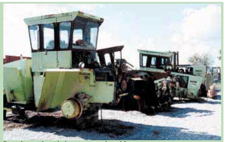
Burned out and wrecked tractors are salvaged for parts.