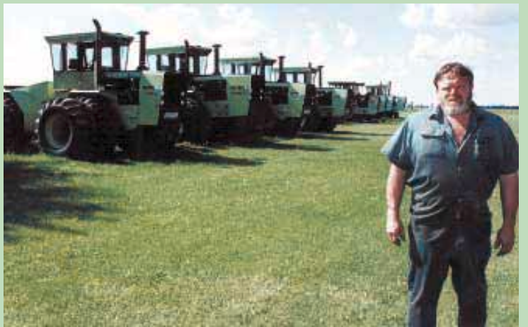
Beery and some of the Steiger series III Panthers he keeps on hand. The four at left are for lease; the others kept for parts. Five other tractors were still out with customers.