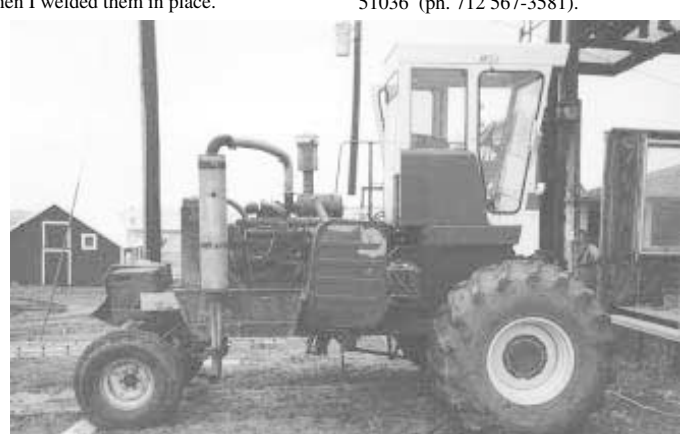
To counterbalance the load on front, Hawkins hangs 1,800 lbs. of tractor weights on back of frame. "I've lifted as much as 8,000 lbs. on the fork with no problems," he says.

He set the engine behind and slightly below the cab, leaving it exposed for access. "That way, it's also a counter weight for the fork lift, too," he says."The biggest problem was making brackets to attach the forklift. I had a local machine shop cut the brackets from 3/4-in. plate steel to fit the drive axle. Then I welded them in place.