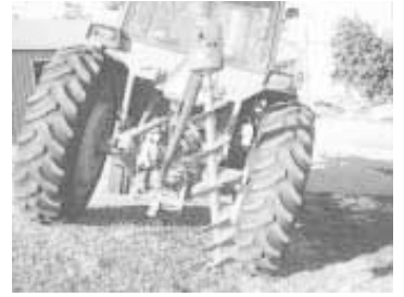
U-joint type swivel on top of auger gearbox allows auger to rotate from side to side and forward or backward on hillsides.

Contact: FARM SHOW Followup, Edwin Kolar, 889 23rd Ave., Wolbach, Neb. 68882 (ph 308 246-5344).