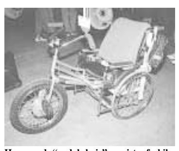
Homemade "pedal chair" consists of a bike frame and front wheel fitted with pedal cranks.

"The cylinders work so well that I can sit and pedal without touching the handlebars and the pedal chair will still continue forward