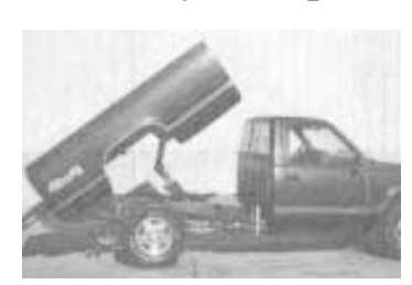
Bolt-on kit lifts box up to a 45 degree angle in 10 seconds with a maximum load.

Kits sell for $849 and are available to fit all Ford, Chevy and GMC pickups from 1973 to 1999, as well as Dodge pickups from 1984 to 1999