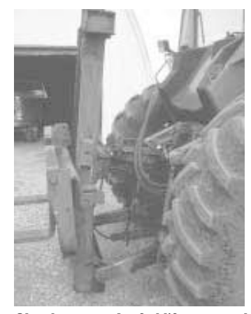
Obrecht mounted a forklift mast on the 3-pt.'s lower lift arms and mounted a hydraulic cylinder in place of the top link so he can tip the forks.

Contact: FARM SHOW Followup, Dave Obrecht, Rt. 1, Zearing, Iowa 50154 (ph 515 434-2017).