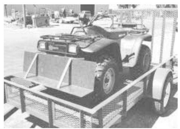
Steel deflector, bent to a 90 degree angle, mounts across front of ATV to deflect weeds.