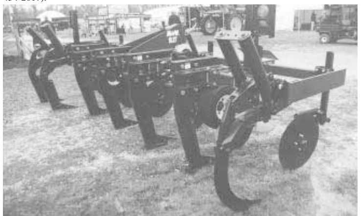
You can fit M & W Gear's new straight-line ripper with three different types of shanks and also add a variety of different points.