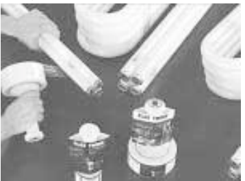
Can be used for any wrapping chore or even as a temporary clamp in the shop.

07746-0161 (ph 800 631-2172 or 732 591-1140; fax 8477).