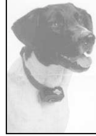
Receiver collar is powered by two 3-

Contact: FARM SHOW Followup, Radio Systems Inc., 10427 Electric Ave., Knoxville, Tenn. 37932 (ph 800 675-8360; fax 423 777-5415; Website; petsafe.com; in Canada, 877 832-7233).