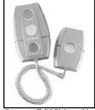
"Space-age traffic light" helps any driver park perfectly.

Contact: FARM SHOW Followup, Exeter zone.com).