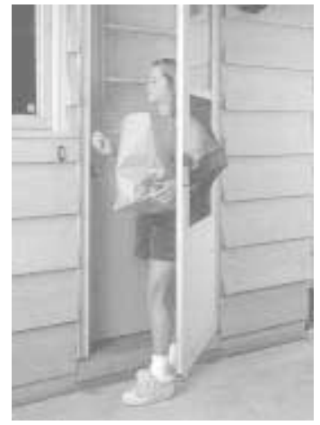
New screening is made from a flexible nylon material that stands up to abuse.

Contact: FARM SHOW Followup, Elgar Products Inc., 5250 Naiman Parkway, Solon, Ohio 44139 (ph 800 321-4970 or 440 349-2297; fax 3662; Website: www.elgar-