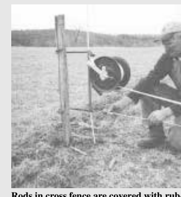
Rods in cross fence are covered with rubber hose to insulate them.

The temporary fence is electrified by simply running a jumper wire from the permanent fence to the temporary fence tape.