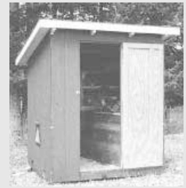
Inside of shed is equipped with racks and hooks for fencing supplies.