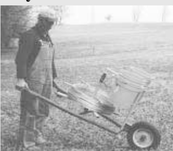
Device rolls along like a wheelbarrow

The bracket holding the two pails lifts off