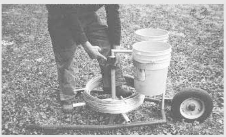
"Jenney" carries a roll of wire and a pair of 5-gal. pails for carrying supplies.