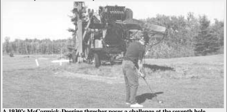
A 1930's McCormick-Deering thresher poses a challenge at the seventh hole.