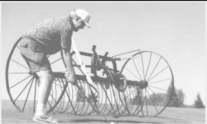
Golfers must decide whether to pitch over, chip around or blast through a hay rake that stands in the middle of a fairway.