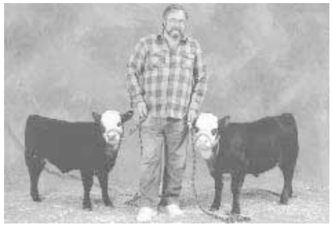
Standing just 36 to 48 in. tall, Kentshires are outstanding producers of high quality milk and beef, according to Gradwohl.