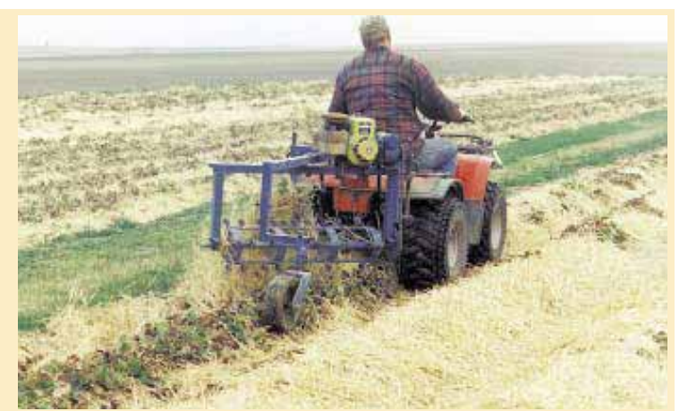
One-row mulch remover works like a side delivery rake to pull straw mulch off strawberry plants at the end of winter. Conrady pulls the machine with a 4-wheeler ATV.

Contact: FARM SHOW Followup, DSLA Co., Rt. 3, Box 115, Sisseton, S. Dak. 57262 (ph 800 387-3752; fax 605 698-7492).