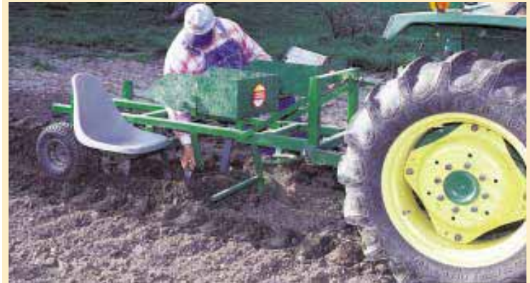
Planter holds two riders. A pair of hoppers holds whatever's being planted. The tractor 3-pt. lifts the entire planter and riders.

machines to handle some of the work. Contact: FARM SHOW Followup, Dale Conrady, Rt. 2, Hettick, Ill. 62649 (ph 217 436-2510).