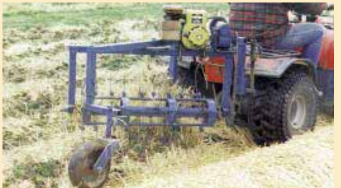
Mulch remover consists of spring tines welded to a small reel that's chain-driven at one end by a 3 hp motor.

The frame of the machine is made from square tubing. It attaches to the cargo rack on the ATV with a couple of brackets. A single caster wheel on back, which came off a Deere cultivator, holds the reel at the proper height to peel straw off the row.