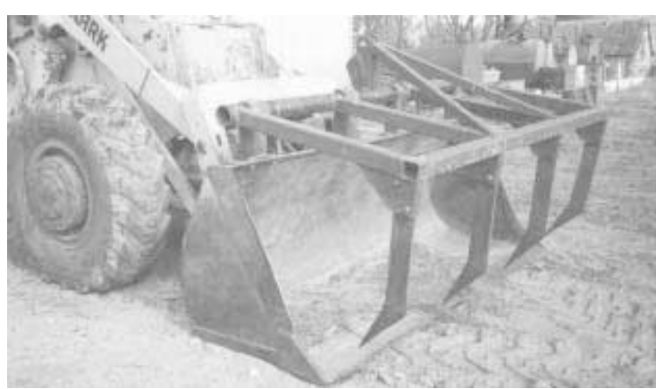
Rectangular frame supports four forks made of 4-in. wide, 3/4-in. thick flat iron.