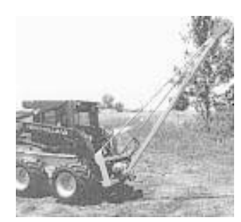
Boom operates hydraulically and offers a maximum reach of 32 ft.

Boom is equipped with 8,000-lb. winch and 5/16-in. cable.