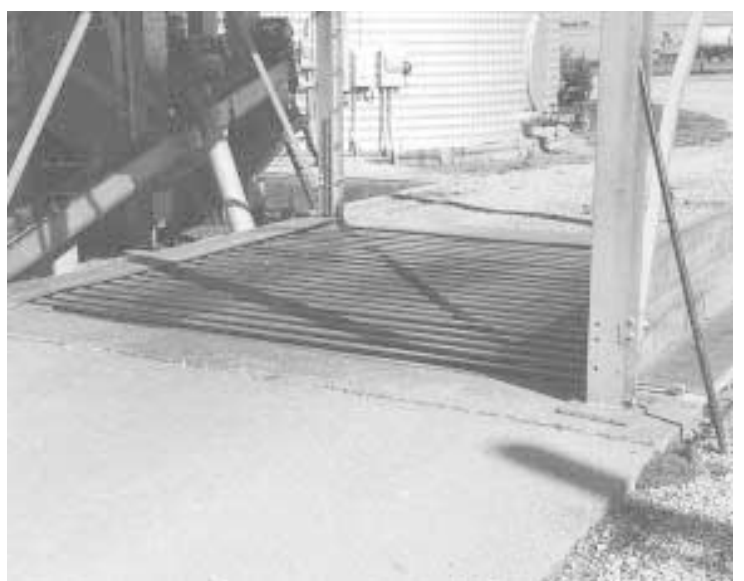
Home-built pit holds 500 bu. and is covered by 10-ft. long railroad rails.

Contact: FARM SHOW Followup, Steve Peters, Rt. 2, Box 88, Clark, S. Dak. 57225 (ph 605 886-7442 or 605 882-5284, ext. 211).