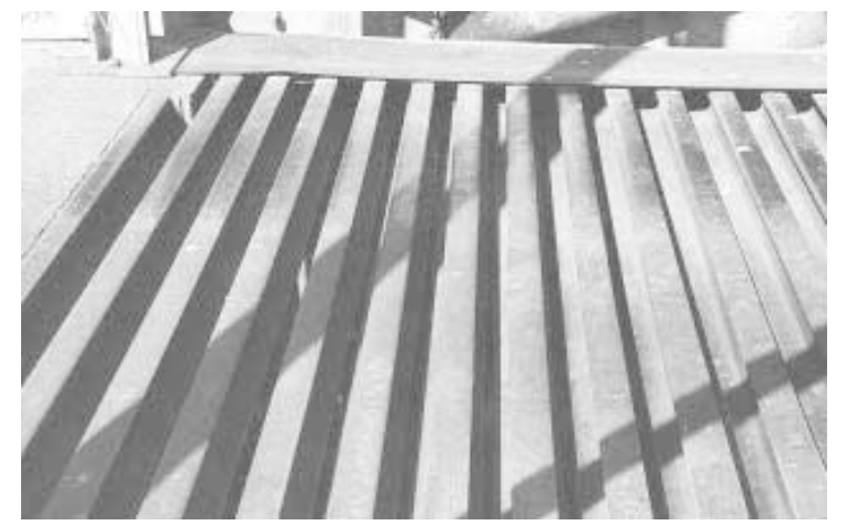
Steel I-beam (not visible) runs crosswise under rails to help support weight of tractors and wagons.

Contact: FARM SHOW Followup, Larry Martin, 1882 700 Ave., Lincoln, Ill. 62656 (ph 217 732-3349).